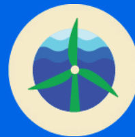
Positive Value Chain